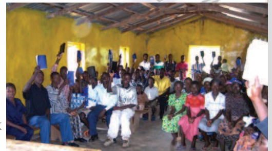
This Ghanaian congregation eagerly anticipates replacing their New Testaments with complete Bibles soon.

The committee decided to wait until the Bibles arrive in Wa, and then we will set the date of the celebration. In the meantime, we will enjoy our Bibles. I still think we will line the streets with a parade of jubilation on the day the truck carrying the shipment rolls into town.